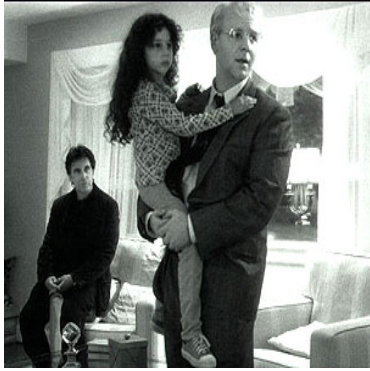
Al Pacino (Lowell Bergman) and Russell Crowe (Jeffrey Wigand) are the 60 Minutes producer and the whistleblower in The Insider .