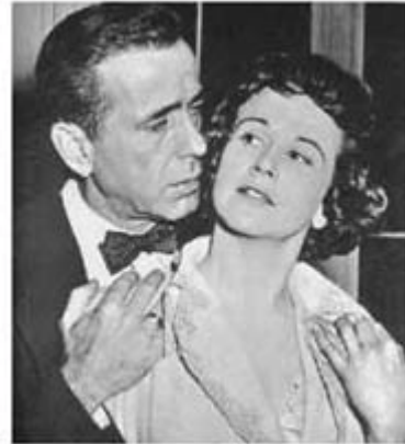
Bogart and ex-wife Nora (Kim Hunter)