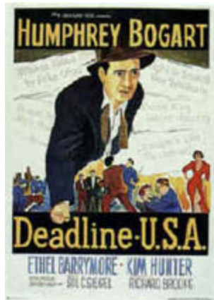
Poster from the film