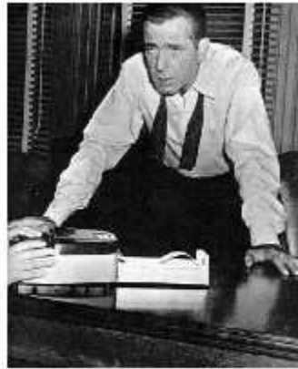
Humphrey Bogart Managing Editor